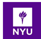
New York University