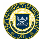
University of Michigan